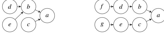
Figure 3. The argumentation frameworks AF_1 (left) and AF_2 (right) from Example 4

Attack vs Full Defense For every acyclic AF = (A, R) , for all a, b \in A , |\mathcal{B}_-(a)| = 0 , |R_1^-(b)| = 1 , and |R_2^+(b)| = 0 then aS_{AF}b and not bS_{AF}a . (An argument without any attack branch should be ranked higher than an argument only attacked by one non-attacked argument.)